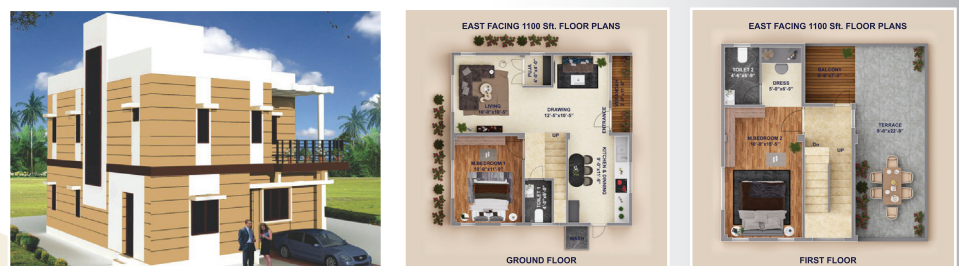
East Facing 1387 Sft. Floor Plans