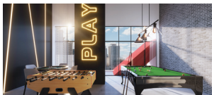
Indoor Children's Gaming Zone