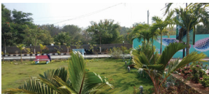
Lush Green Lawn with Event Space