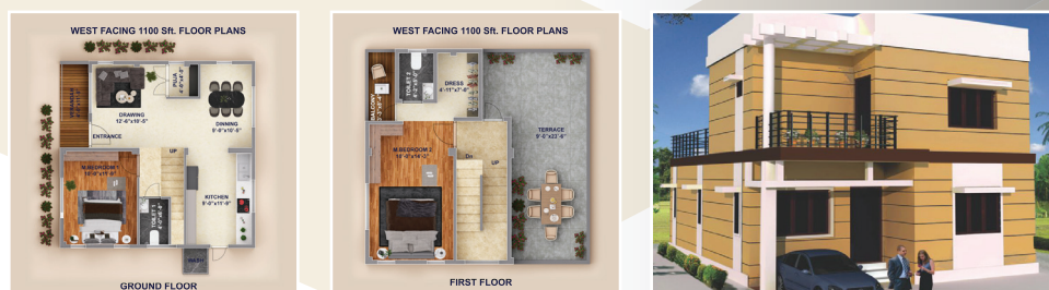
West Facing 1100 Sft. Floor Plans