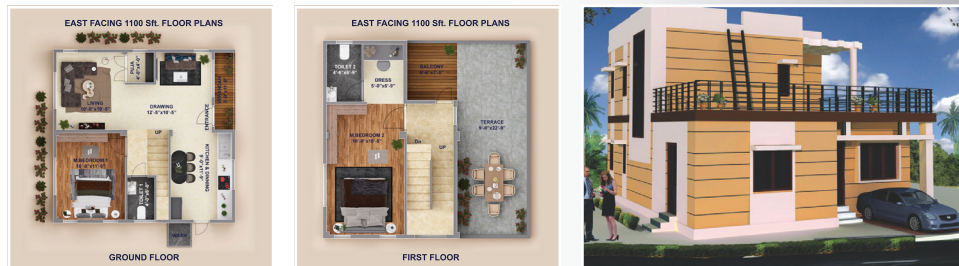
East Facing 1100 Sft. Floor Plans