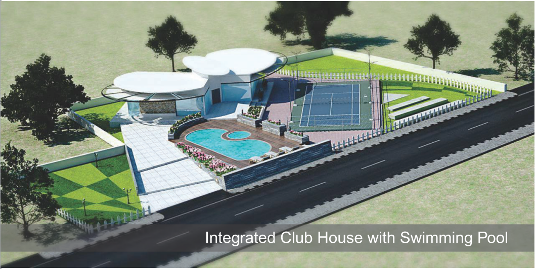
Integrated Club House with Swimming Pool