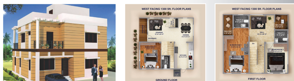
West Facing 1387 Sft. Floor Plans